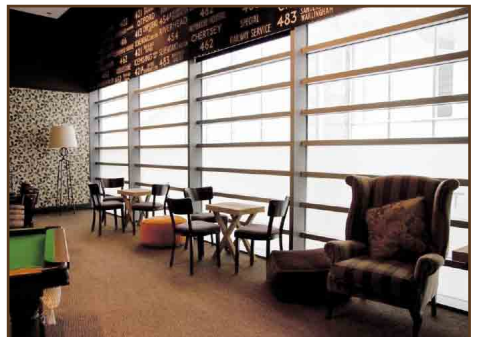
THE CLUB ROOM