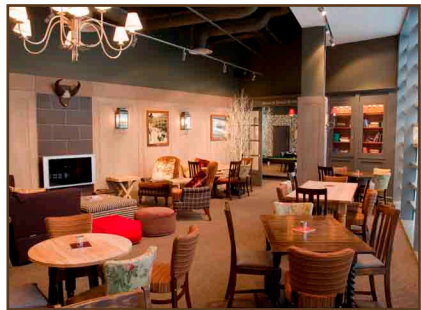
THE FIRST FLOOR